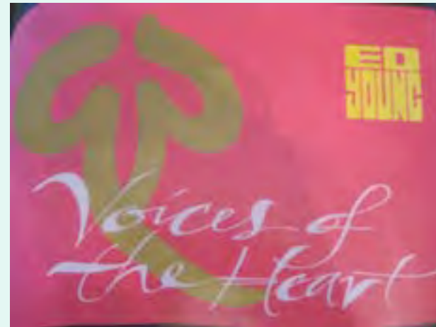
Voices of the Heart