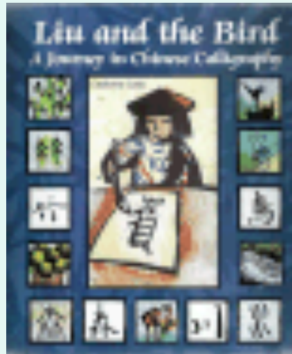
Liu and the Bird

These children's books use Chinese calligraphy to tell a story while telling more about calligraphy. You can find them at the library or at a book store.