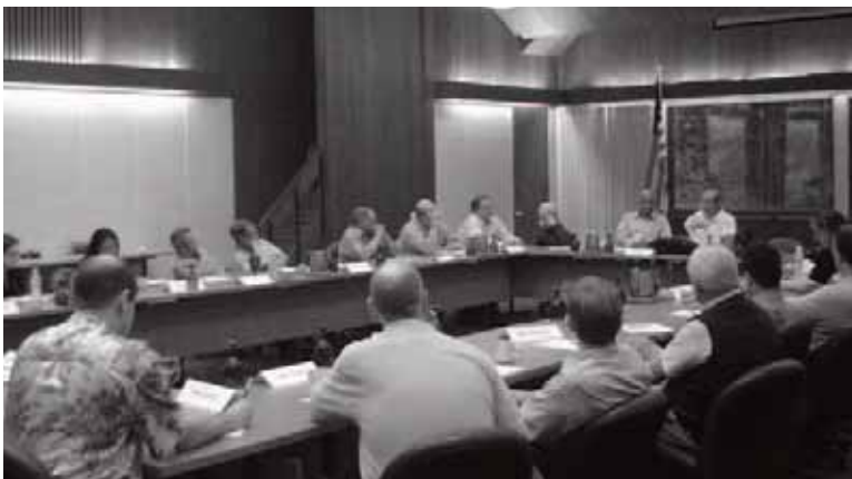
Participants in the conference "China, the United States and the Emerging Global Agenda" in Queenstown, Maryland

The Policy Leaders Orientation Program helps mid-career Chinese policy makers enhance their understanding of the United States and their dealings with Americans through an intensive two-week introduction to U.S. politics, history, culture and society. While many Chinese officials have regular contact with Americans, they have fewer