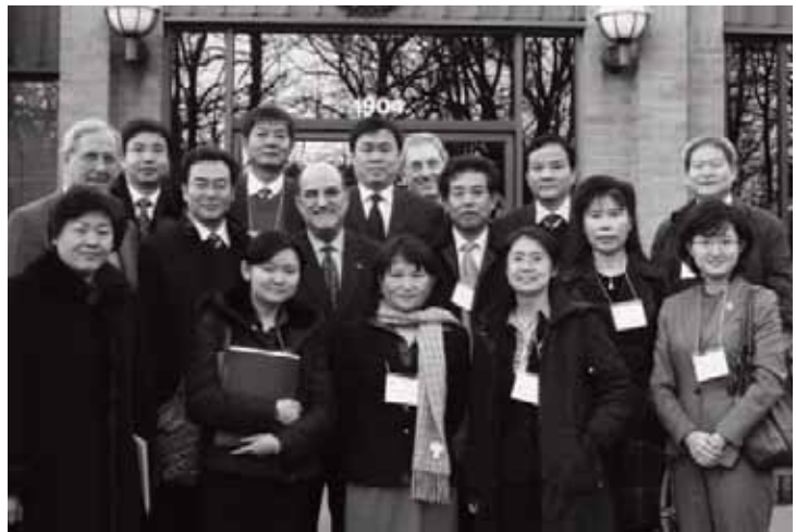
Chinese secondary school principals and senior administrators visit the National Association of Secondary School Principals in Reston, Virginia

trators able to drive change in their districts and individual schools. Of particular interest to the participants was the emphasis on individualism and creativity in American education, and the focus on collaboration and problem-solving. They enthusiastically planned to share their experiences with colleagues after their return to China, to adapt some American innovations into their schools, and to increase communication and exchange between Chinese and American schools.