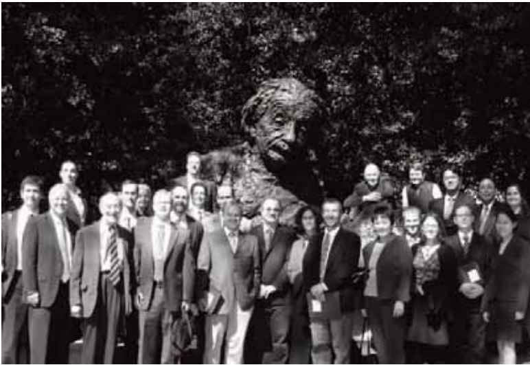
Public Intellectuals Program fellows and advisory committee members visit the National Academy of Sciences in Washington, D.C.

Exchange (SLE) took twelve of America's most outstanding high school seniors on an intensive two-week study tour to China, where they experienced aspects of China's history, society and culture that ordinary visitors rarely see, while forging new friendships and lasting connections with China.