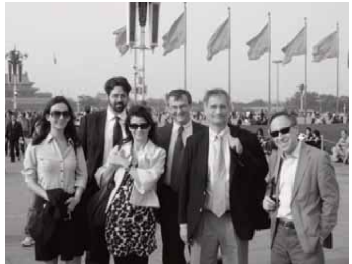
The Delegation of Foreign Policy and Public Affairs Journal Editors, pictured at Tiananmen Square, Beijing, included senior representatives from The American Interest, International Security, The American Prospect, The National Journal, Ethics & International Affairs and Slate