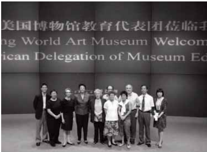
Museums and Educational Outreach exchange participants were the centerpiece of a major conference at the National Art Museum of China in Beijing

engage and educate the general public and China's youth.