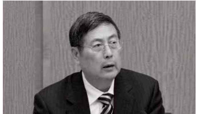
Vice Premier Huang Mengfu, chairman of the China Foundation for Human Rights Development, at Harvard's Fairbank Center for Chinese Studies

forum in China on philanthropy and human rights and Mr. Huang viewed his visit as a key opportunity to initiate this and other programs in these areas, which play critical roles in U.S.-China relations.