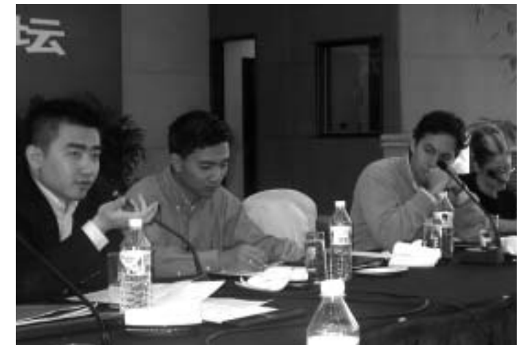
YLFers shared their views on change and tradition during panel presentations.