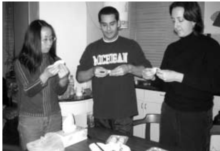
Outside the classroom, American teachers in China received instruction in making dumplings.