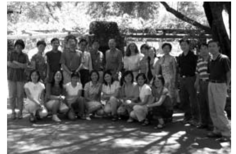
Chinese teachers took part in an orientation program before starting the school year at their American schools.

teachers gave lectures on the U.S. education system and civics education; another contact developed through the Teachers Exchange Program arranged a