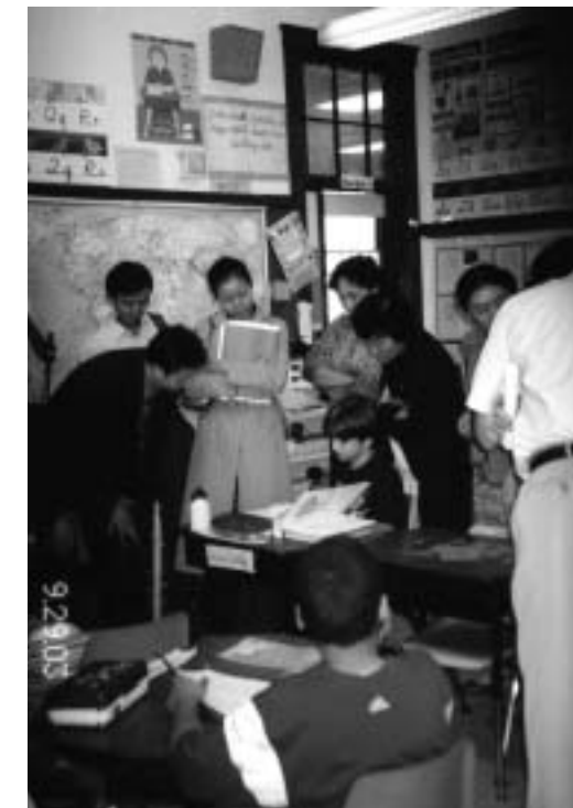
Members of the Educators Delegation found time spent in American classrooms to be especially valuable.

The delegation's stops in Boston, Philadelphia, Washington, Atlanta, Oklahoma City, Tulsa and San Francisco