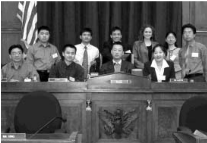
Students enjoyed a site visit to Capitol Hill.

shaping foreign policy and public opinion. The students broke into small groups one afternoon for site visits to 15 foreign policy-related government agencies and non-governmental institutions. A simulation exercise gave participants a chance to put in practice some of the concepts they were exposed to over the course of the FPC.