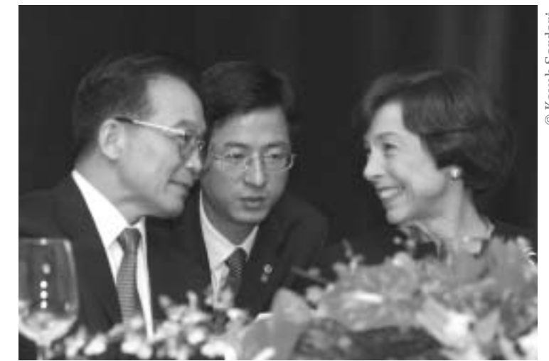
National Committee Chair Carla Hills welcomed Premier Wen Jiabao to a Washington dinner in his honor.