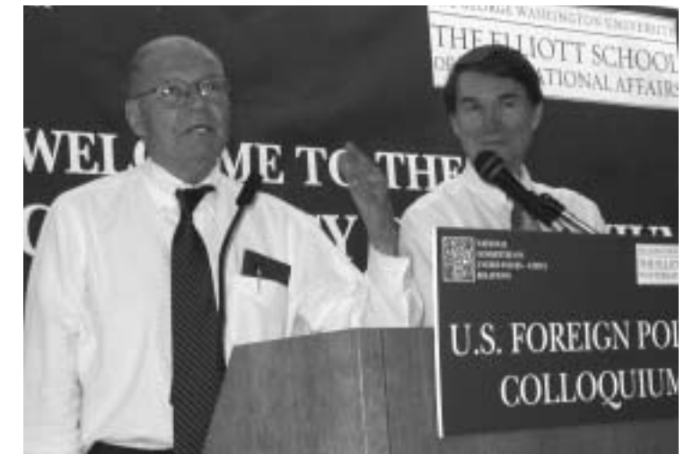
Robert McNamara answered students' questions about the Cuban missile crisis.

engineering, biotechnology, computer science and other technical and scientific fields are heavily represented in the ranks of the Chinese leadership elites. International affairs and political science specialists were in the minority; all