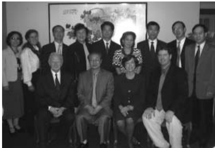
Former Securities and Exchange Commissioner Rod Hills (seated, left) and former U.S. Trade Representative Carla Hills (seated, second from right) shared their perspectives with the Anti-Corruption Delegation.

In recent years, the National Committee’s programs in the field of governance and legal affairs have focused primarily on judicial and civic leaders, recognizing that effective implementation of the law requires professional staff, adequate