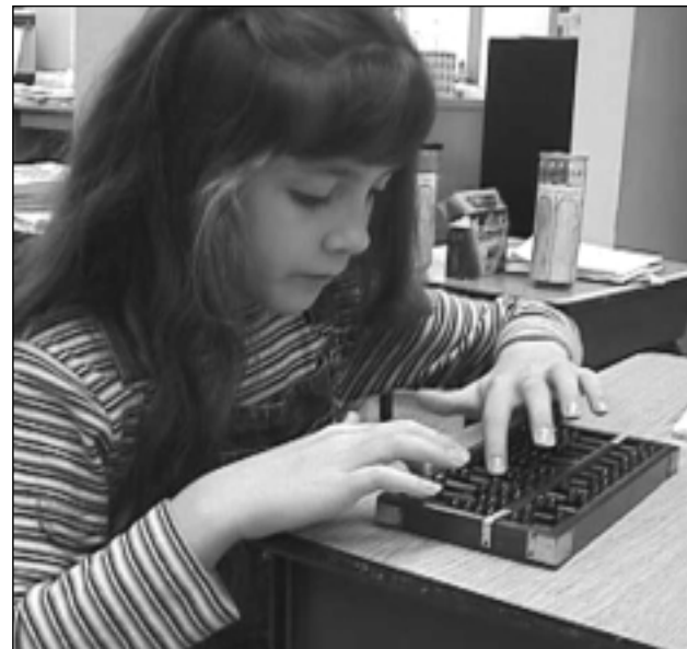
A student in Virginia uses a traditional Chinese tool—the abacus.

Then there's the language, which conveys this sense of foreign yet familiar best of all. I teach young children, some of whom at the mention of China have been known to pull at