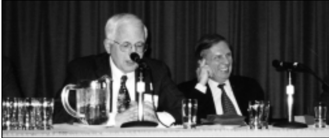
Former Ambassadors to China J. Stapleton Roy (left) and Winston Lord (right) entertained National Committee members with anecdotes from their days in Beijing.

The board commended the National Committee staff for the programs it had conducted in 1999 and discussed several new program activities that might effectively address changing social and economic conditions in China. Members and directors also approved the slate of new directors which will make up the board’s Class of 2002 (see page 14).