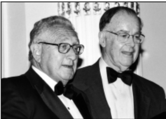
America-China Society chairman Henry A. Kissinger and National Committee chairman Barber B. Conable, Jr. used the occasion of the Gala Dinner to announce the proposed merger of the two organizations.