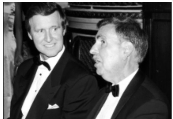
Among the distinguished guests at the September 8 event was Secretary of Defense William S. Cohen, shown here with dinner chairman Gerald M. Levin, chairman and chief executive officer of Time Warner Inc.