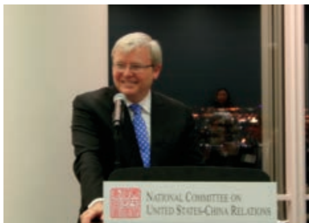
Australian MP Kevin Rudd (December 18)

The Honorable Kevin Rudd, Member of Parliament, Australia December 18, Covington & Burling