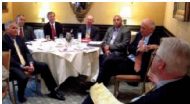
Participants in the China Seminar for Senior Navy Personnel in Washington, D.C.