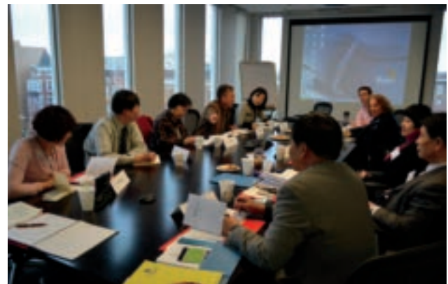
The K-12 Physical and Arts Education Delegation visits the American Alliance for Health and Physical Education, Recreation and Dance in Washington, D.C.