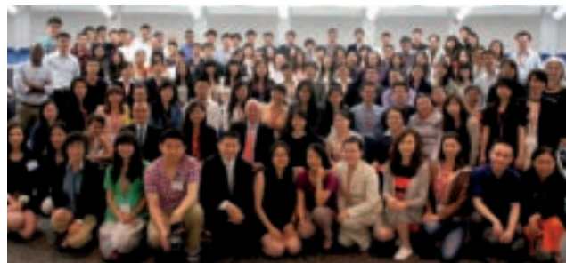
U.S. Foreign Policy Colloquium participants

Over 150 PRC graduate students from universities throughout the United States convened in June at The George Washington University in Washington, D.C., for the ninth Foreign Policy Colloquium, a three-day seminar that exposes participants to the complex influences that shape American foreign policy. Participants engage with scholars, government officials, and other opinion makers to learn about the nuts and bolts of foreign policy-making, and to visit think tanks, NGOs, government offices, advocacy groups, and corporations involved in the foreign policy process.