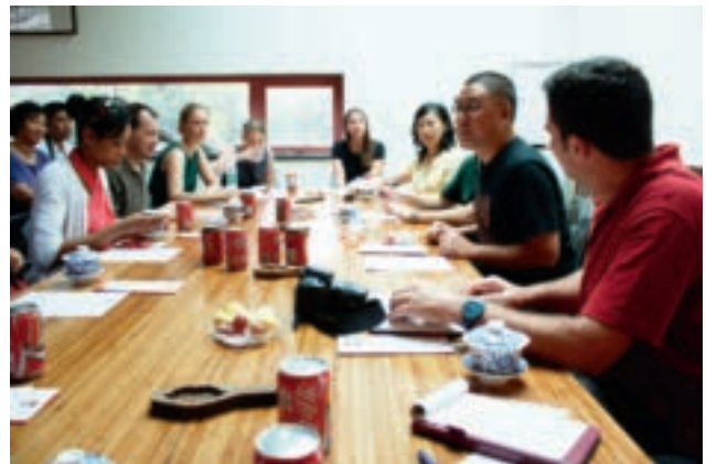
Senate Staff Delegation with the founder of the Jianchuan Museum Cluster in Chengdu, Sichuan

In 2012, the National Committee took three delegations of Congressional staff to China, with participants drawn from Washington, D.C., offices as well as state and district offices. Conducted in accordance with the Mutual Education and Cultural Exchange Act, these exchanges familiarize the participants with the successes and challenges of China's development and its rapidly changing society.