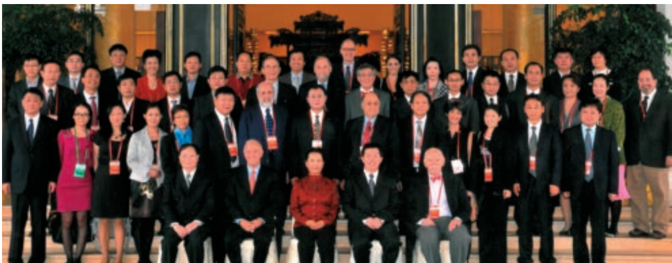
Participants in the Sino-American Dialogue on the Rule of Law and Human Rights

This track II dialogue explores the nexus of human rights and issues surrounding China's legal institutions. Conducted in partnership with the China Foundation for Human Rights and Development, the meeting brings together legal scholars, judges, and advocates. Participants gathered in December on Hainan Island for the fourth round of the dialogue that focused primarily on the draft amendments to China's Criminal Procedure Law that went into effect in January, 2013.