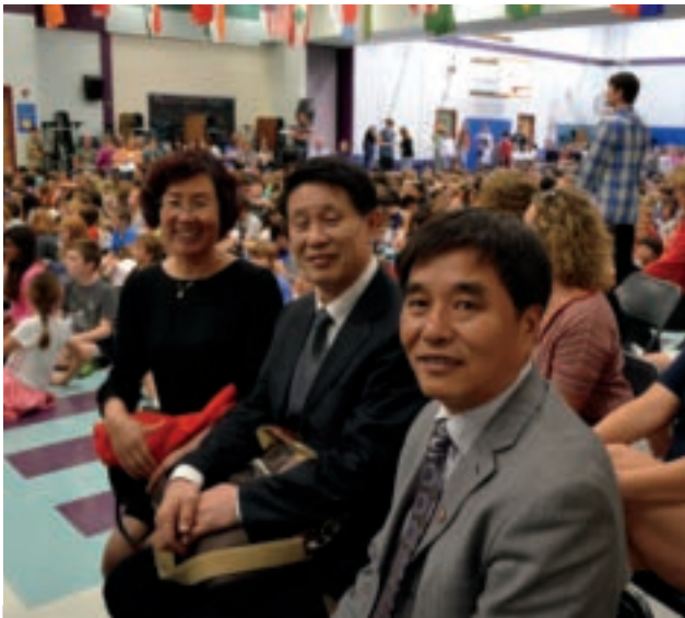
K-12 Physical and Arts Education Delegation members at Veteran's Day celebration, Joe Dan Mills Elementary School, Austin, Texas

In 2012, the National Committee administered two education delegations on behalf of the U.S. Department of Education to provide Chinese educators, administrators, and education officials firsthand exposure to the structure, successes, and challenges of educational institutions around the United States. The spring delegation focused on international student services at American colleges and universities, study abroad programs, and the historical and socio-economic background of education in the United States; the theme of the fall delegation was K-12 physical and arts education, educational facilities and school-community relations.