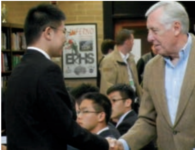
Chinese Student Leaders Exchange participants meet with U.S. Representative and Democratic Whip Steny Hoyer in Maryland