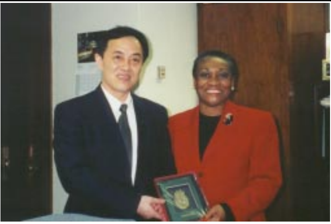
Judge Xi presents Judge Baldwin with a gift during the Court Specialization delegation's visit to Pittsburgh..

Despite a full schedule of meetings, the group also participated in some cultural activities (their favorite being a rodeo in Oklahoma City). The delegation members returned to China full of ideas and suggestions and eager to begin adapting them to fit the Chinese system.