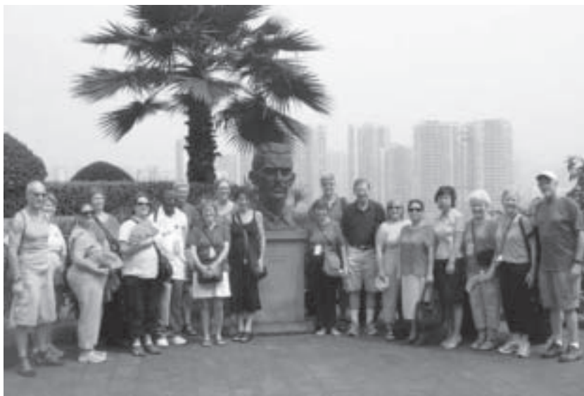
Fulbright History and Culture seminar participants at a statue of General Joseph W. Stilwell in Chongqing