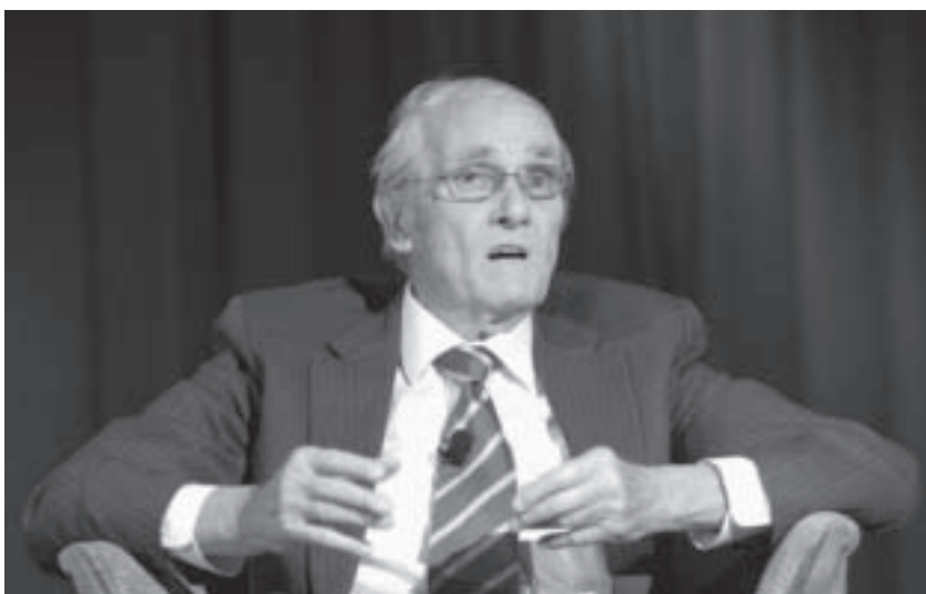
Ambassador James Lilley at the National Committee program Once Upon a Time in Beijing, December 2008

being one of the most eloquent and thoughtful interlocutors in our on-going dialogue, participating in six of them and supporting them with generous financial contributions. He also pioneered the first segment of what has turned into another of our long-term Track II projects, leading a delegation of four recently retired four-star military leaders to China during a time when our two militaries had no communication.