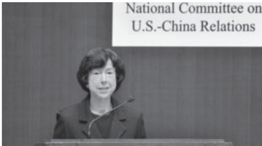
National Committee Chair Carla A. Hills giving the 2010 Barnett-Oksenberg Lecture in Shanghai

Ambassador Carla A. Hills, chair of the National Committee and chair and CEO of Hills and Company, delivered this year's Barnett-Oksenberg Memorial Lecture on Sino-American Relations to an audience of more than 300 people on March 2, 2010, in Shanghai. Entitled "U.S.-China Relations: Challenges and Opportunities," the address encouraged leaders of the two countries to develop a habit of meeting together regularly to ensure cooperative and productive relations and collaboration on issues of global concern. A video of the lecture may be viewed on the National Committee's web site.