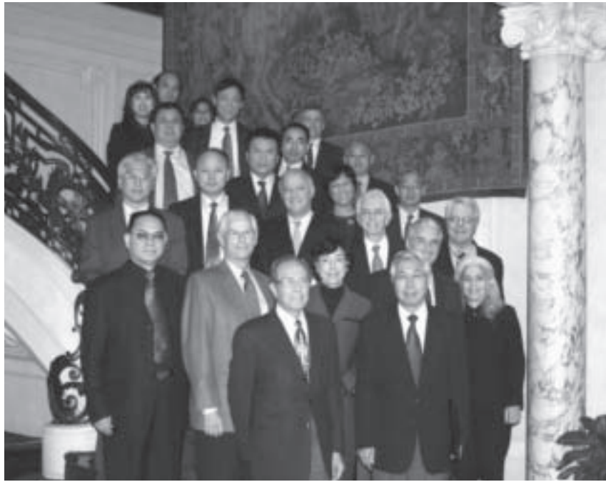
Strategic Security Issues Dialogue participants in Washington, D.C.

The delegation also had several continued on page 27