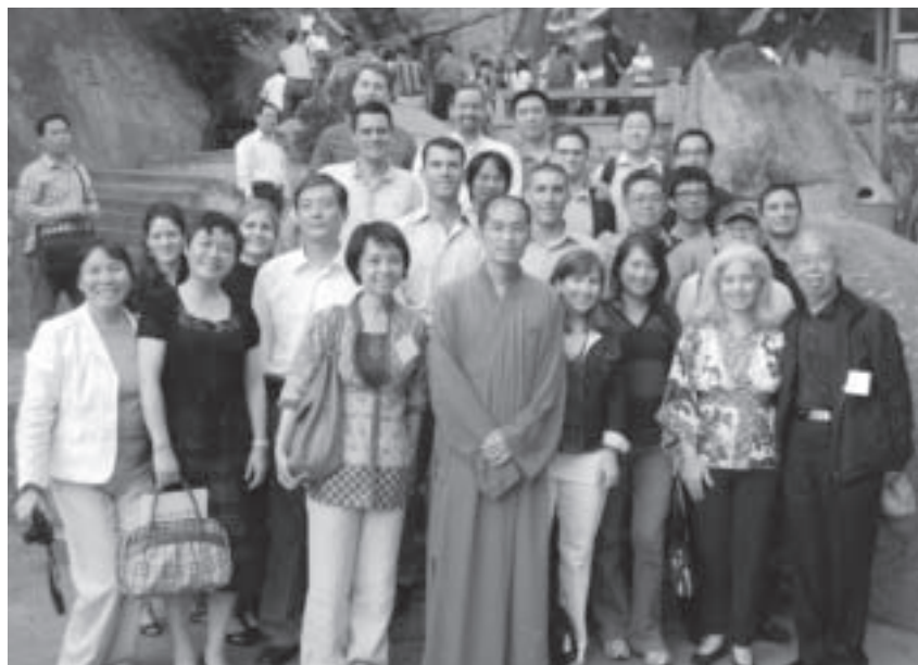
Participants at the 2009 Young Leaders Forum in Xiamen visited Nanputuo Temple