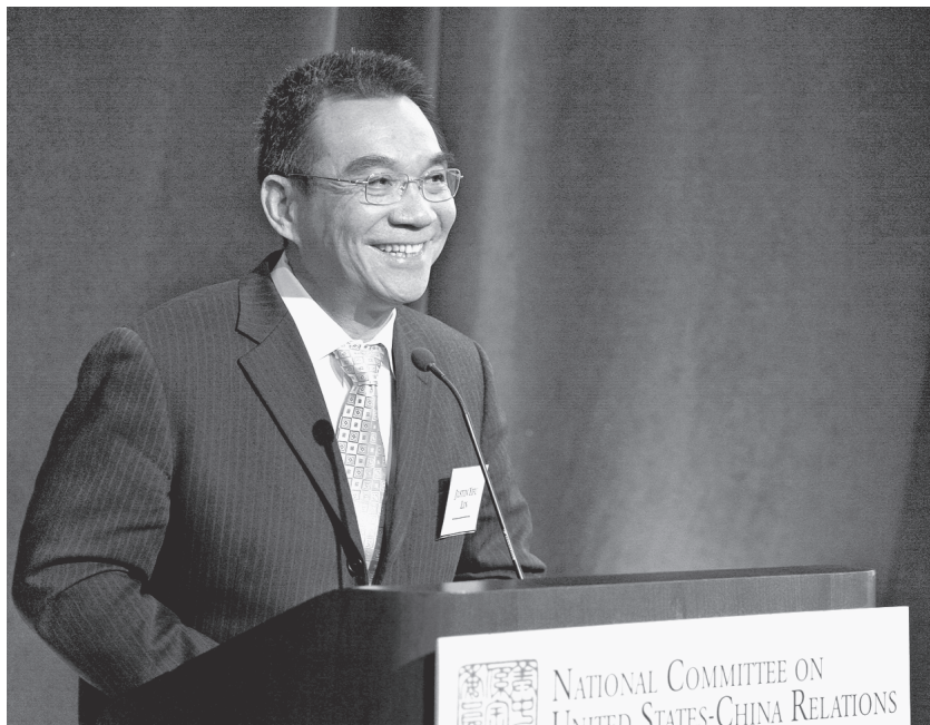
Justin Yifu Lin, Chief Economist and Senior Vice President, World Bank, at the NCUSCR forum on China's economy in 2010 held at the NYSE

To offer fresh perspectives on the outlook for China's economy in 2010, the National Committee collaborated with the China Center for Economic Research (CCER) to present a half-day forum at the New York Stock Exchange on January 7, featuring forecasts and analyses by leading Chinese economists. A capacity crowd of over 350 Wall Street professionals and about 50 journalists attended.