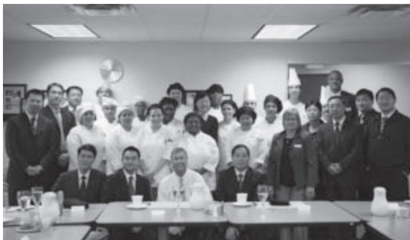
The University Career Counseling Delegation visiting Remington College, outside of Dallas, where a meeting on career services included lunch prepared by Remington culinary students

China wants to develop entrepreneurs, and delegation members