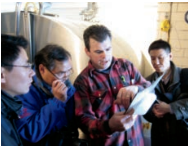
The Policy Leaders Orientation delegation visited the Brandt family dairy farm in Annville, Pennsylvania

Though the Washington itinerary was rich with engaging briefings and site visits, the stays in the homes of D.C.-area residents was perhaps the experience that left the most lasting impression. As has been our tradition for all such programs, we asked members and friends of the National Committee to open their homes to one or two delegation members. Not only were we delighted to have several Committee members agree to be hosts, but this year we had a number of new families, all of whom have children attending the Yuying Public Charter School, which offers a Chinese language immersion program. For these families, the experience of having a member of the delegation stay with them, share meals and sit around at night talking provided their children an exciting opportunity to put their Chinese skills to use and practice with a native Chinese speaker. But it wasn't just the families that benefited; the home stays were consistently cited by the Chinese visitors as an