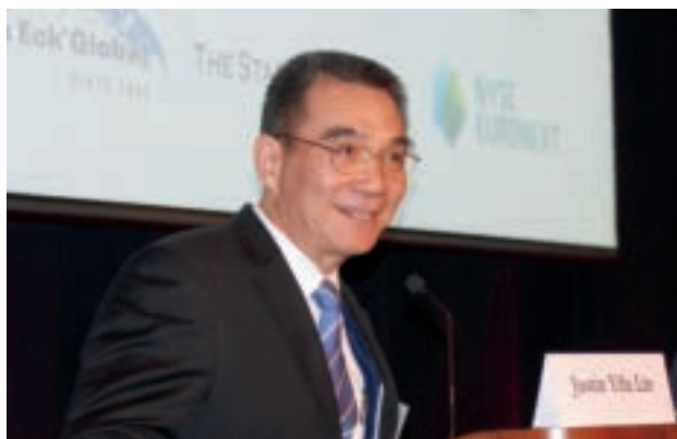
Justin Yifu Lin, Professor and Honorary Dean, National School of Development, Peking University

The National Committee is grateful for the generous support from Xcoal Energy & Resources, Van Eck Global, The Starr Foundation and NYSE Euronext that made this year's forum possible. ■