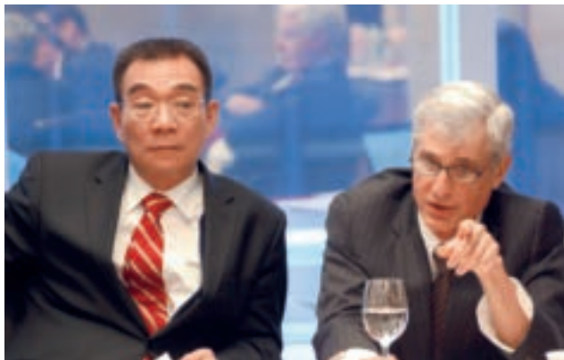
Justin Yifu Lin and Robert E. Rubin