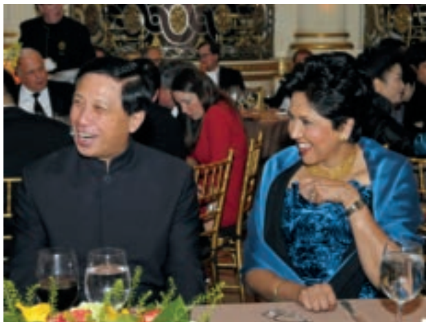
Chinese Ambassador to the United States Zhang Yesui with PepsiCo Chairman and CEO Indra Nooyi

This year's honorees were selected for the exceptional contribution their companies have made to the