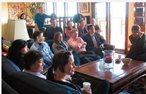
Public Intellectuals Program fellows meeting in San Francisco

Associate Professor, Fordham University School of Law