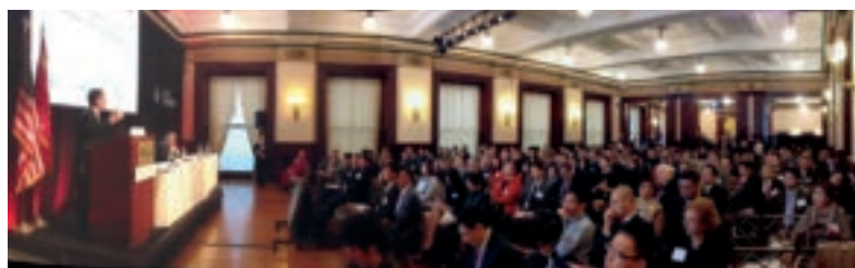
Forum attendees at the New York Stock Exchange