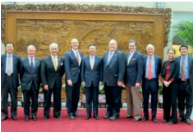
Members of the Congressional Members Delegation with State Councilor Yang Jiechi in Beijing