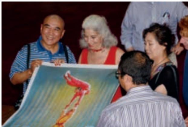
NCUSCR Vice President Jan Berris presents a copy of a poster used for the Shenyang Acrobatic Troupe's 1972 U.S. tour to the two performers depicted in the poster. The original, signed by all 77 members of the delegation, hangs in the Committee's foyer

After the mainland portion of the program, PIP fellows spend another two to three days in either Taiwan or Hong Kong. The 2012 visit to Taiwan was informative, not just for the excellent series of meetings, but also because few of the fellows had ever been there. Excellent conversations and meetings were had with Deputy Foreign Minister Kuo-yu Tung; the mayor of New Taipei City, Eric Chu; Michael Ying-mao Kau, former vice foreign minister and professor of political science at Brown; DPP legislator Bi-khim Hsiao; Mainland Affairs Council Minister Lai Shin-yuan; Diane Ying, the publisher and editor-in-chief of