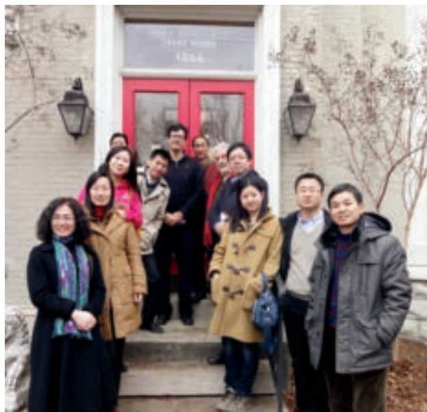
The International Student Services Delegation visiting the Asia Institute Crane House in Louisville

The delegation's three days in Phoenix included visits to a skills center and two campuses within the Maricopa Community College system that gave the group an appreciation for the value of community colleges, and provided insights into issues of credit transfer, diversity, continuing education, and workforce development. The delegation was particularly interested in the process of assigning credit for life experience. Meetings at Arizona State University included a long discussion of the university's overseas programs and initiatives to integrate foreign