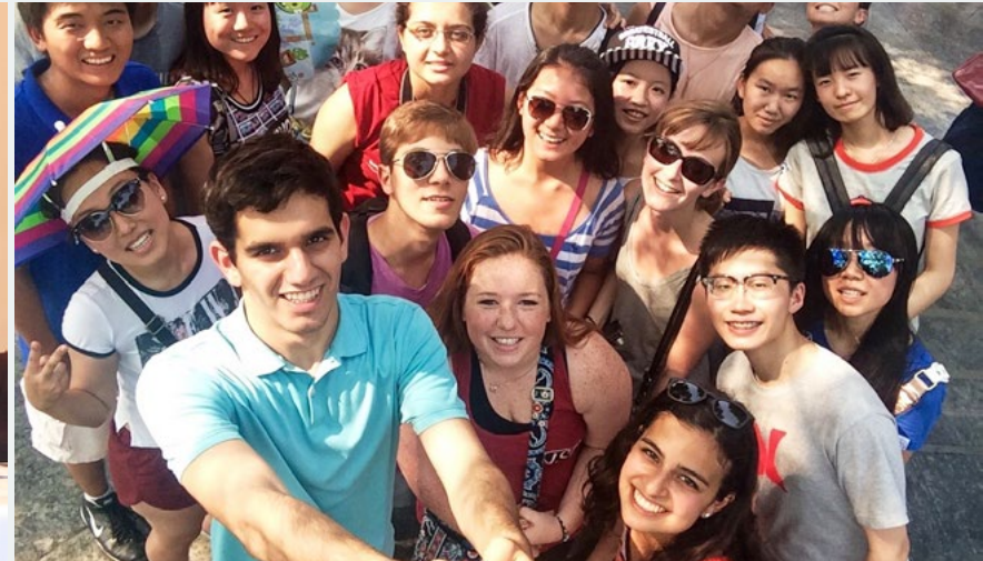
Student Leaders Exchange participants and host siblings take a group picture together in Beijing at the Forbidden City, July 2015