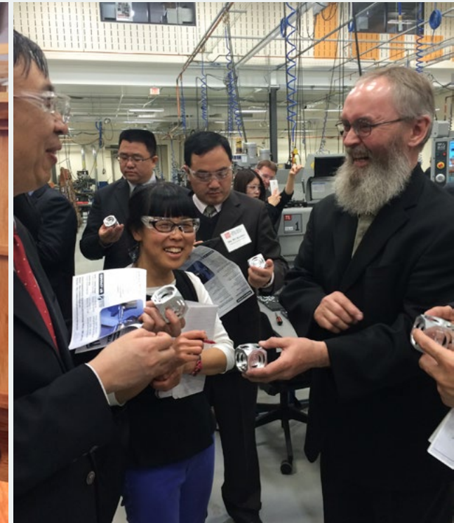
Educators and administrators in the May 2015 Education Delegation, focused on vocational education, at Madison Area Technical College in Wisconsin