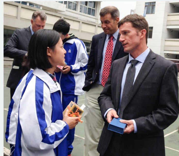
U.S. Pacific Command officers and analysts visit with students at Shi Shi High School in Chengdu, November 2015

Since 2007, the National Committee has run a series of D.C.-based multi-day briefings for mid-career officers in the U.S. Navy, Air Force, Army, and Marines designed to provide participants with a more holistic view of China by focusing on issues not conventionally covered in their military training. In 2013, the United States Pacific Command (PACOM) invited the Committee to hold similar briefings for mid-career and senior officers working on China at its headquarters in Hawaii. Following that successful program, a second briefing was held in March 2015, with ten prominent China experts (including four current or former National Committee directors) providing on-site and videoconference sessions on a range