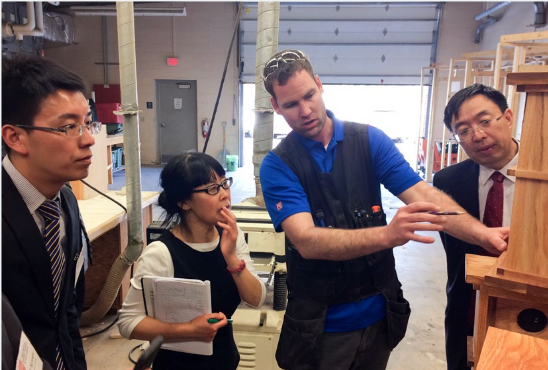
Educators and administrators in the May 2015 Education Delegation, focused on vocational education, at McFarland High School in California

academic environments and encourage entrepreneurship through on-campus incubators, technology centers, and innovation research institutes; the importance of relationships among schools, local businesses, governments, and NGOs in supporting innovation; innovative product and patent transfer mechanisms between professors and universities; and the role of angel investors, venture capitalists, and philanthropic networks in supporting entrepreneurial efforts. As one participant wrote afterwards, “Our [China’s] universities should strive to cooperate with more innovative companies and recruit talent and faculty who have experience in innovation management.” Another noted that, “When conducting the second round of [my university’s] entrepreneurship competition, I want social entrepreneurship to be one of the categories by which the students’ business ideas are judged.”