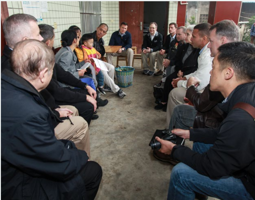
U.S. Pacific Command officers and analysts meet with a family in Danling County, Sichuan Province, November 2015