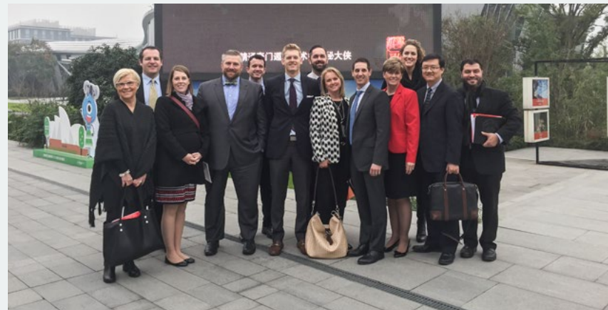
District-based congressional staff visit Alibaba headquarters in Hangzhou, December 2015