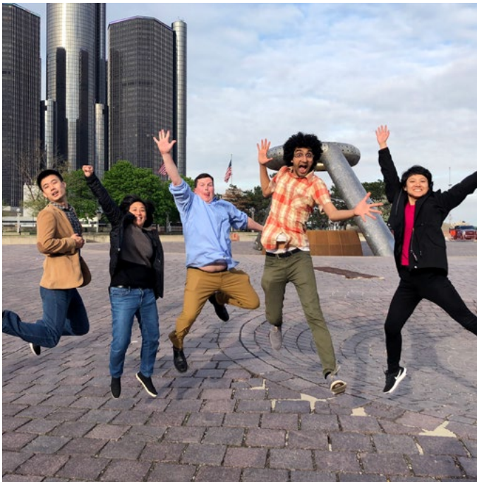
Chinese and American Young Leaders Forum fellows making a video during a team-building activity during the Detroit forum in May.

This two-year fellowship nurtures the next generation of American China specialists by expanding their networks, broadening their areas of expertise, and encouraging them to assume prominent roles to inform and engage policymakers and the public. Conferences, capacity-building sessions, China trips, and networking opportunities enhance participants’ skills, contacts, and opportunities for public engagement. Funded by Carnegie Corporation of New York, the program now comprises 100 fellows who have formed a strong network of mutual support and academic collaboration.