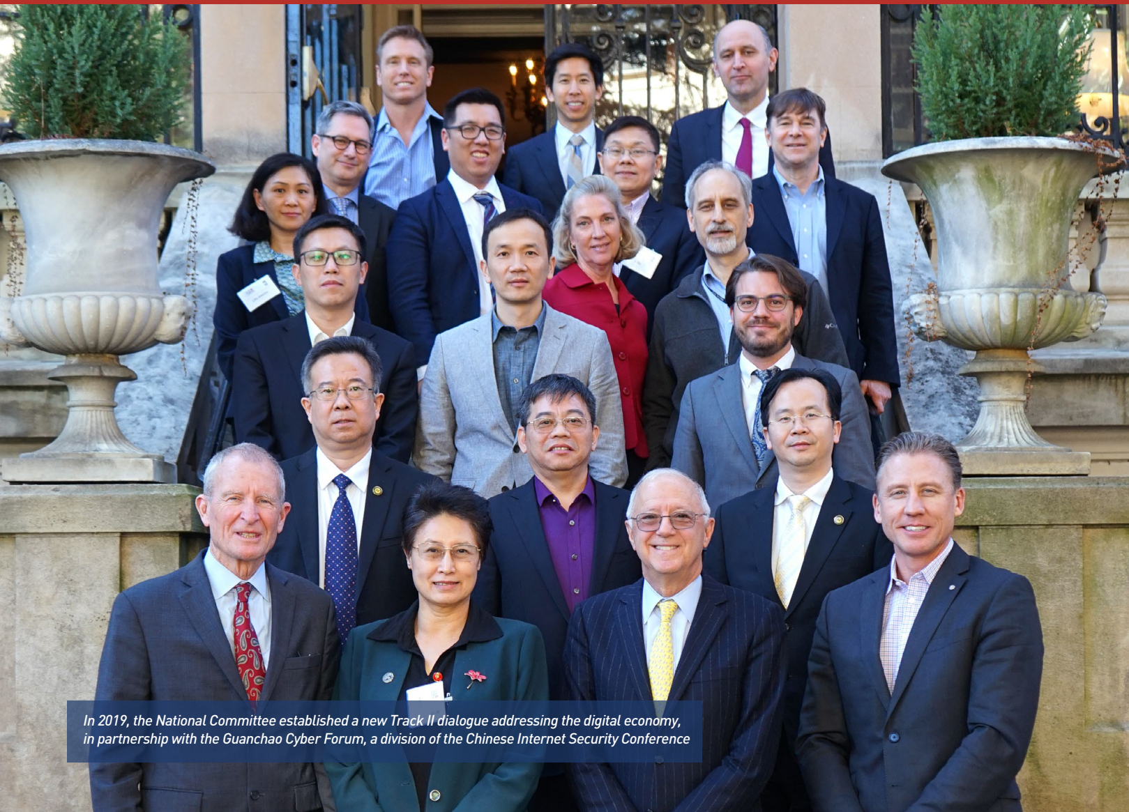
In 2019, the National Committee established a new Track II dialogue addressing the digital economy, in partnership with the Guanchao Cyber Forum, a division of the Chinese Internet Security Conference

Fostering ongoing dialogue and cooperation around the most sensitive issues facing the bilateral relationship