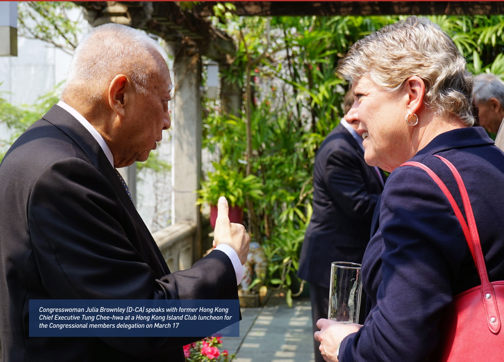
Congresswoman Julia Brownley (D-CA) speaks with former Hong Kong Chief Executive Tung Chee-hwa at a Hong Kong Island Club luncheon for the Congressional members delegation on March 17

Informing policy leaders on both sides of the Pacific