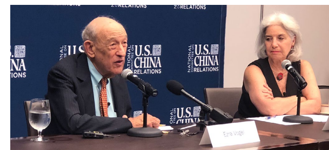
Renowned scholar Ezra Vogel introduces his recent book China and Japan: Facing History at an event in New York

Leading American and Chinese economists and business leaders convened in New York City to make their predictions for 2019 and beyond at the NCUSCR's annual Forecast of China's Economy, held January 10. To foster further dialogue, the Committee also arranged a Washington, D.C. visit, where the Chinese delegation met with colleagues at the Peterson Institute for International Economics, American Enterprise Institute, World Bank, and Atlantic Council.